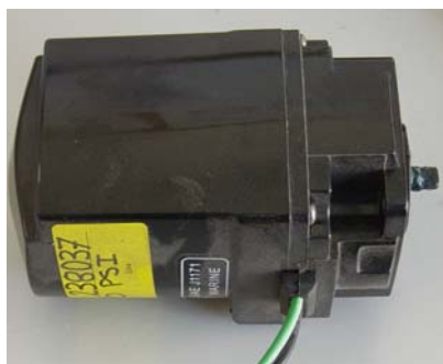
AM Series Wound Motor (Marine Grade)