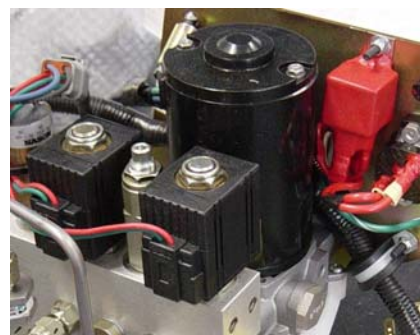
AE Permanent Magnet Motor to be Replaced